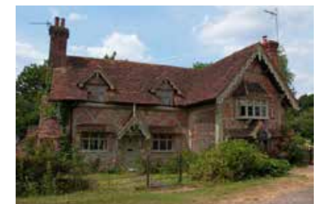
House of Mr Vardell, Copthorne. Where is it?

Don't forget, copies of our book Copthorne, the story so far are available for £10 - a very interesting read for anyone new to the village.